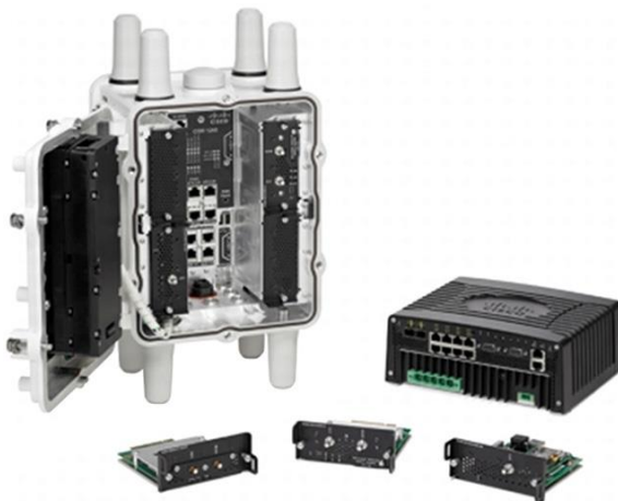
Figure 1. Cisco 1000 Series Connected Grid Routers

The Cisco CGR 1000 Series includes two platforms, shown in Figure 1: The Cisco 1120 Connected Grid Router (CGR 1120), which is designed for indoor deployments; and the Cisco 1240 Connected Grid Router (CGR 1240), which is a weatherproof router in a NEMA Type 4 enclosure for outdoor deployments.