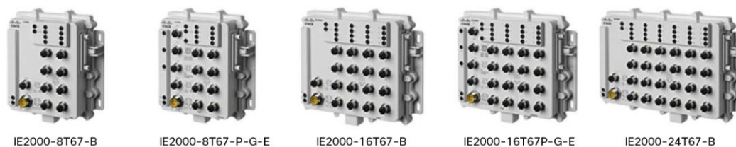
Table 2. Industrial Ethernet 2000 IP67 Series configuration