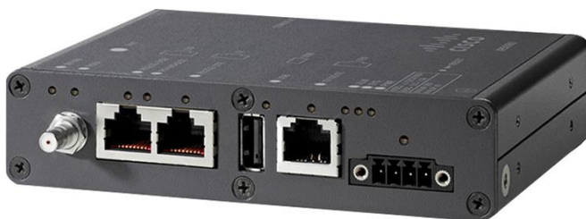
Figure 1. IR500

Figure 1 displays a Cisco WPAN Industrial Router.